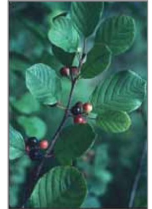
Buckthorn