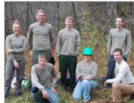
WisCorps crew

A management plan for the Freeman Tract calls for buckthorn removal to begin in areas of the least infestation and work toward the areas that are worse. This prevents buckthorn from reaching the healthy areas. WisCorps will pull small buckthorn and use clippers and brush saws to cut off buckthorn too large to pull. Herbicide will be used on those stems and trunks to prevent re-sprouting.