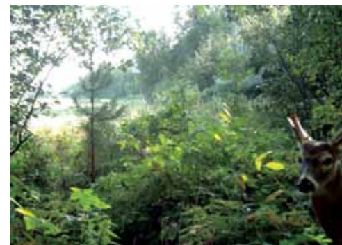
Lincoln County Easement

Whether we preserve nature through public land or easements is less important than making sure we protect enough to provide for the critical habitat and ecological functions that are necessary to perpetuate healthy ecosystems. I am saddened by the decline in fireflies and songbirds. Unless we act, children may never be moved again by the chorus of frogs in the spring, or the dance of butterflies across a prairie.