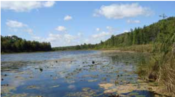
Autumn 2011

The till around Rice Lake contains limestone. Lime is slowly dissolved into the groundwater and carried from the springs into the lake where it precipitates, creating what is called "marl." Most lakes in central and northern Wisconsin are fed from surface water that is acidic. Marl lakes are much less common. Many years ago, marl was dredged from Rice Lake to be used as agricultural lime. Marl adds yet another ecological dimension to the attractiveness of Rice Lake.