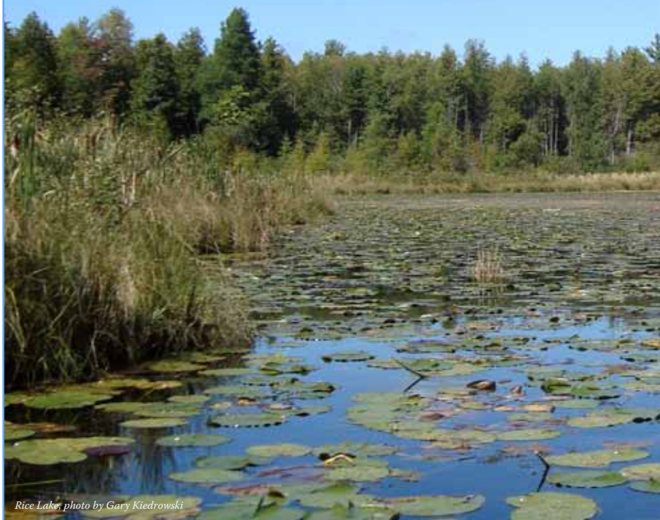
Rice Lake, photo by Gary Kiedrowski