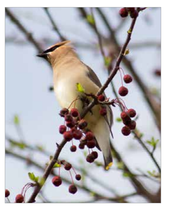
Cedar Waxwing