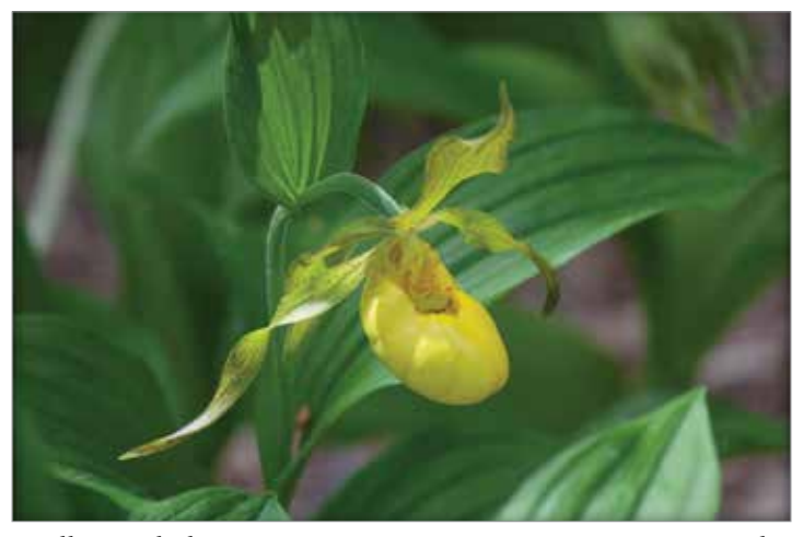
Yellow Ladyslipper as it appears on a Zimmermann notecard. Support NCCT and get your set today!

The goal of this Project is to develop and disseminate materials and educational programs that inform and encourage private landowners to utilize voluntary conservation options as a means to protect priority lands in a Watershed that provides wildlife habitat, ecological services, and recreational opportunities.