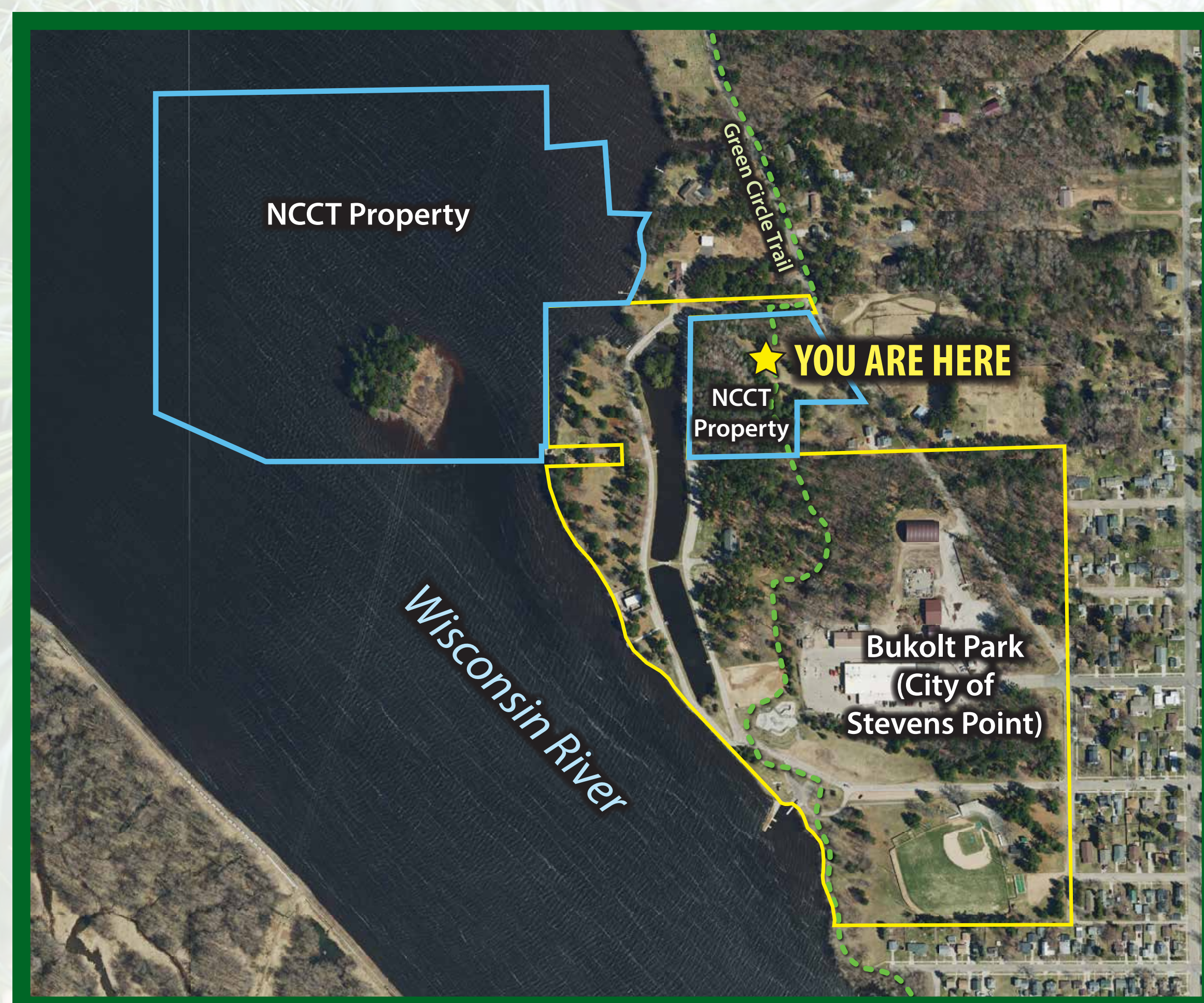
Located adjacent to Bukolt Park, NCCT staff and volunteers worked closely with partners and community stakeholders to develop a vision and strategy for protecting and managing this property.