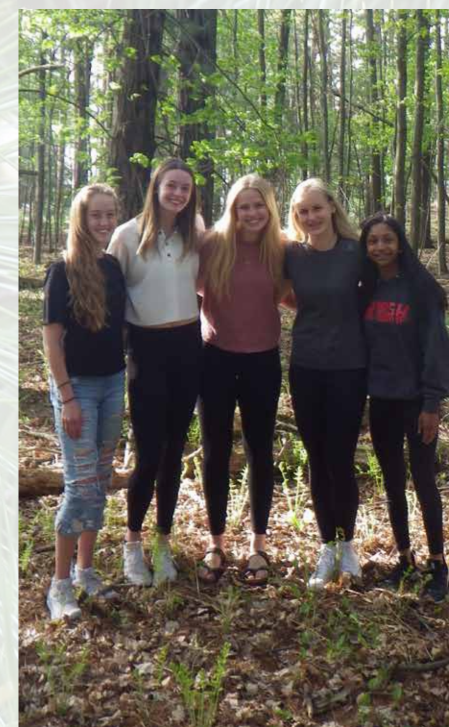
Volunteers from the SPASH cross country team, 2021

There are many opportunities to volunteer with the NCCT, including property stewardship, advocacy, easement site visits, workdays, property walks, and more. Contact us for more information about becoming a member or volunteering!